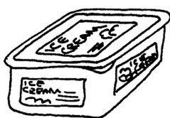
litre of ice cream