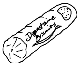
packet of digestive biscuits