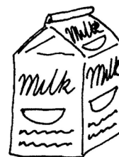
carton of milk